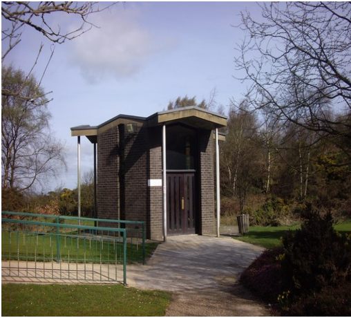
Chapel of Remembrance