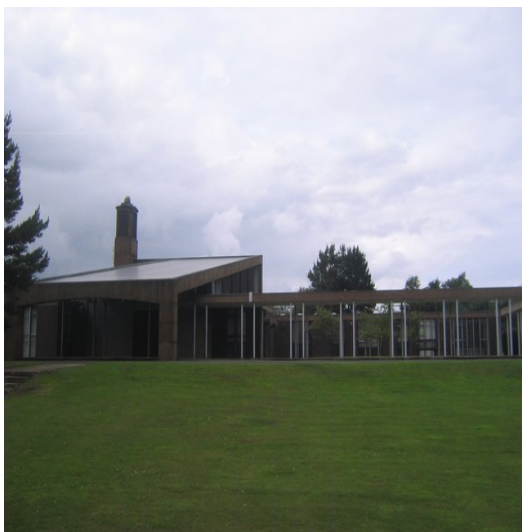
Crematorium general view

As Mountsett Crematorium buildings and the cremator is updated and/or replaced it should be the prime objective to reduce all these figures.