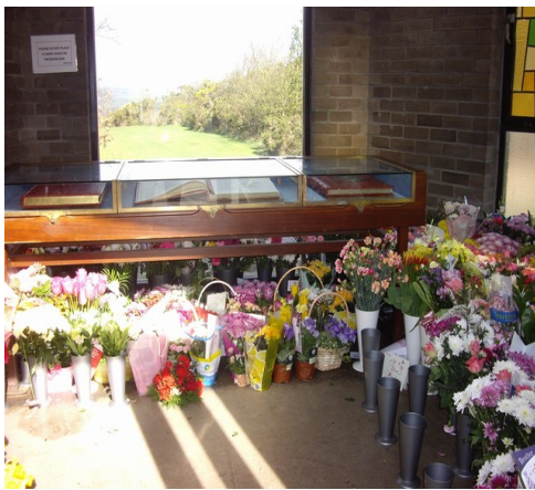
Bookcase within Chapel

be drawn out. It is possible although, we usually find that the premises manager is the best source of knowledge, that there may be other suitability issues that staff/customers may be able to highlight which could, subject to service approval and of course resources are included in the premises Investment Plan.