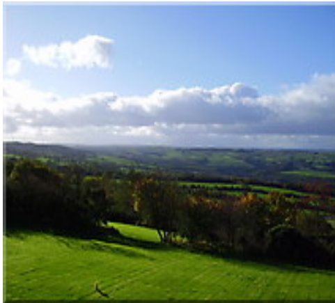
View from Mountsett Crematorium

SAMP and reflected within the performance data detailed in Section 4. This baseline information enables us to view the performance of Mountsett Crematorium and provides a high level overview of investment need.