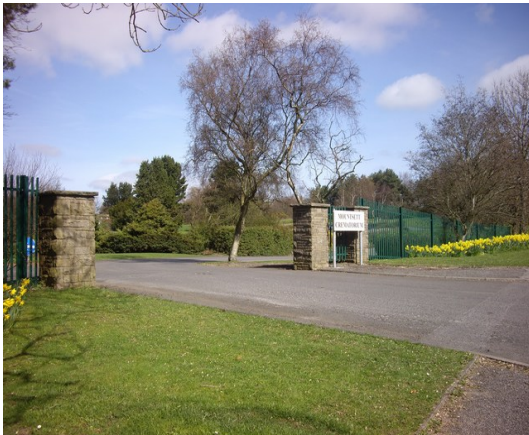
Crematorium front entrance

Full suitability surveys across the whole of the Bereavement Service property portfolio, including Mountsett Crematorium have not been carried out and will need to be addressed to determine whether the current buildings are suitable in terms of service delivery and in the right location. The manager of Mountsett Crematorium has carried out a basic suitability audit, the results of which are set out below at Section 6 (Gap analysis)